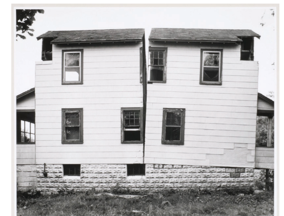
Gordon Matta-Clark - Splitting, 1974