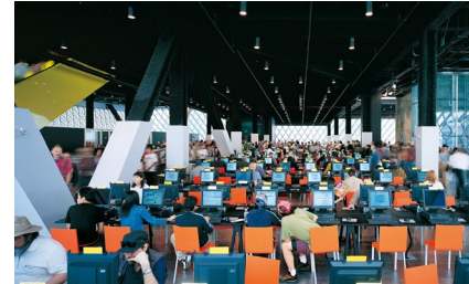
Etienne Louis Boullée, MVRDV, OMA