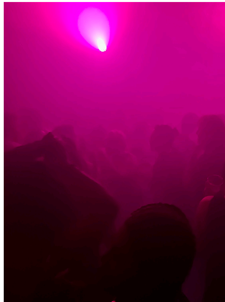
somewhere, sometime #1