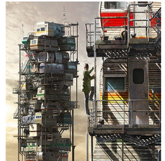
The Stacks in “Ready Player One” Steven Spielberg, 2018