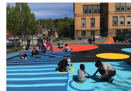
Photos of community engagement sessions and co-design workshops for the playscape at Community Forge, Wilkinsburg, 2019.